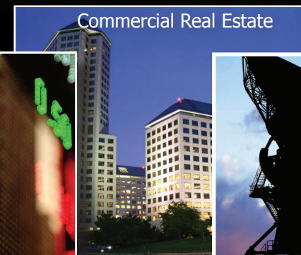
Commercial Real Estate